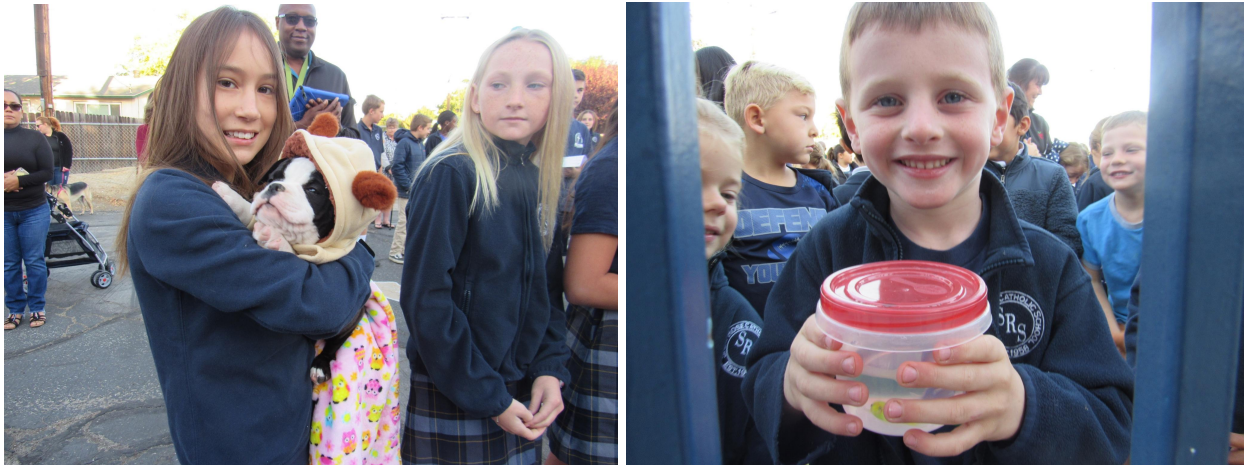
A few pics from previous year's Pet Blessings...

The Pet Blessing is a fun event, and the children always seem to enjoy it. However, I'm not sure about some of the cats, as they are usually significantly outnumbered by the dogs.