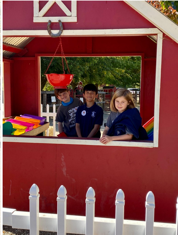
A Fall tradition: St. Rose Catholic School students at the pumpkin patch!

Wine Country Run ½ Marathon and 5K: The run is just around the corner. While it is too late to sign up as an adult participant, your children can still be signed up on this google form . Children will be able to run during P.E. class on November 15 - 17 . Yes, there are some bragging rights and competition involved in this! Please see the information below: