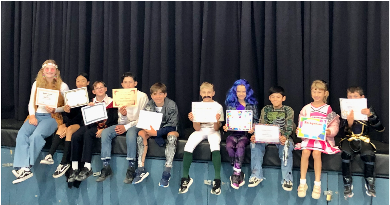
Congratulations to our October Gospel Awards Winners!