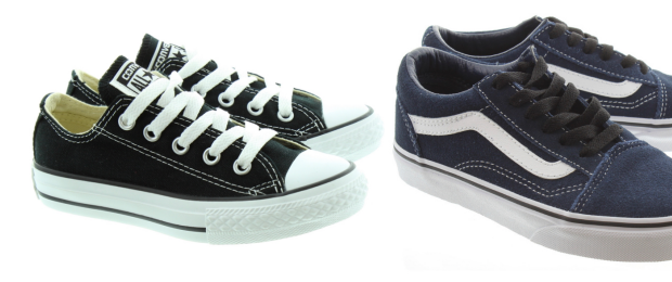
Black Tennis Shoes Blue Tennis Shoes