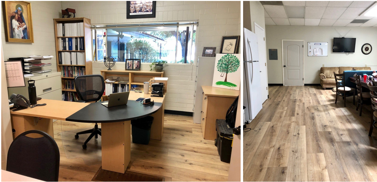
...principal's office and staff room!