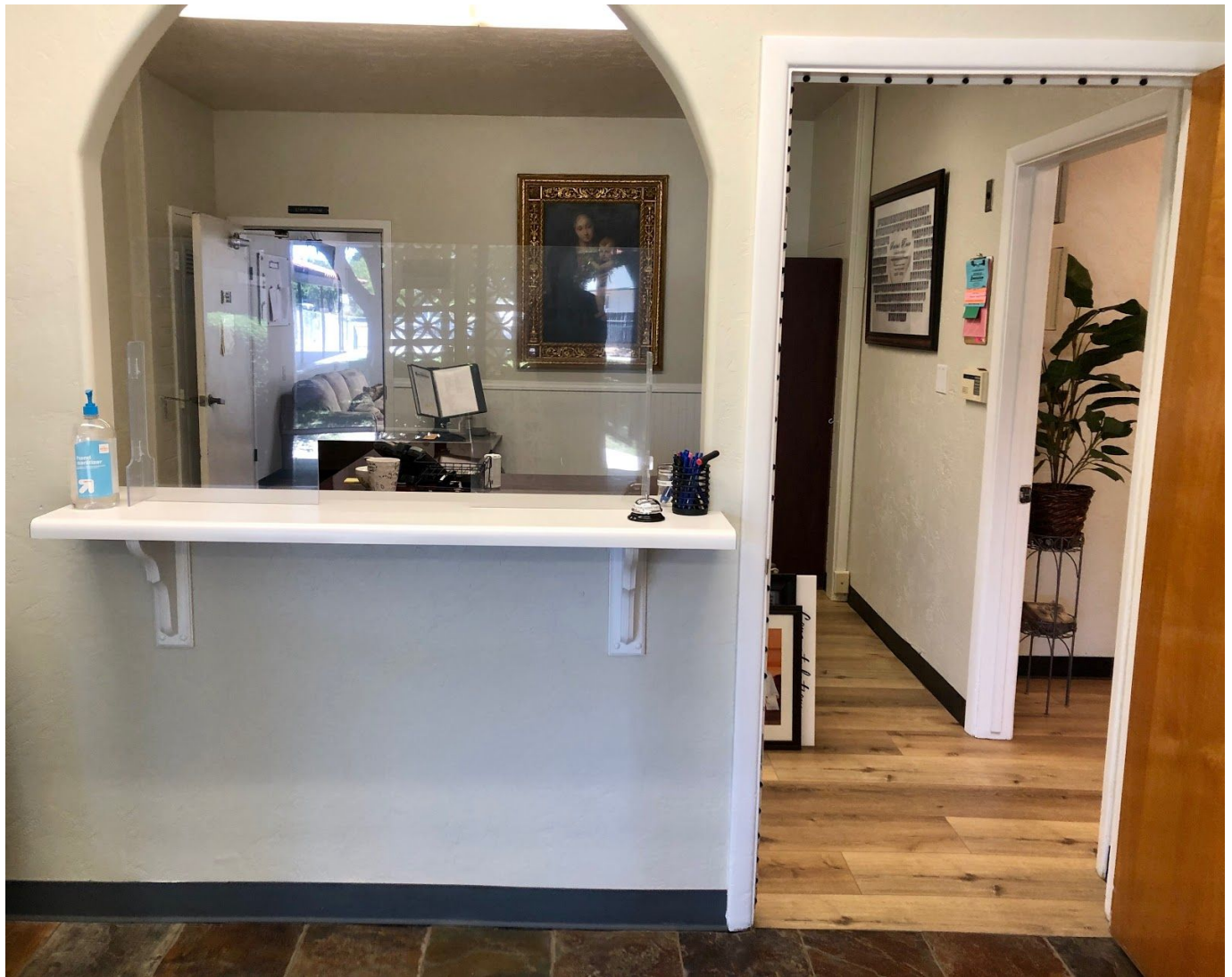
A new look at the front desk....

PTO and SAC Board: I would like to thank both our Parent Teacher Organization and our School Advisory Council for their help and support during the school year and during the summer. Our office has a clean and modern new look thanks to PTO and our SAC Board offered support and advice through last year's distance learning and waiver application meeting. Thank you once again to all members of both of these boards.